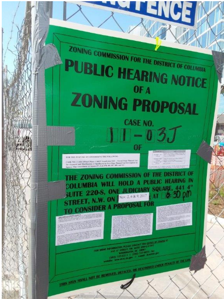
Picture #1 ZC 11-03J- Reposted on 10-2-17 & 10-18-17- 7th and Maine Street SW